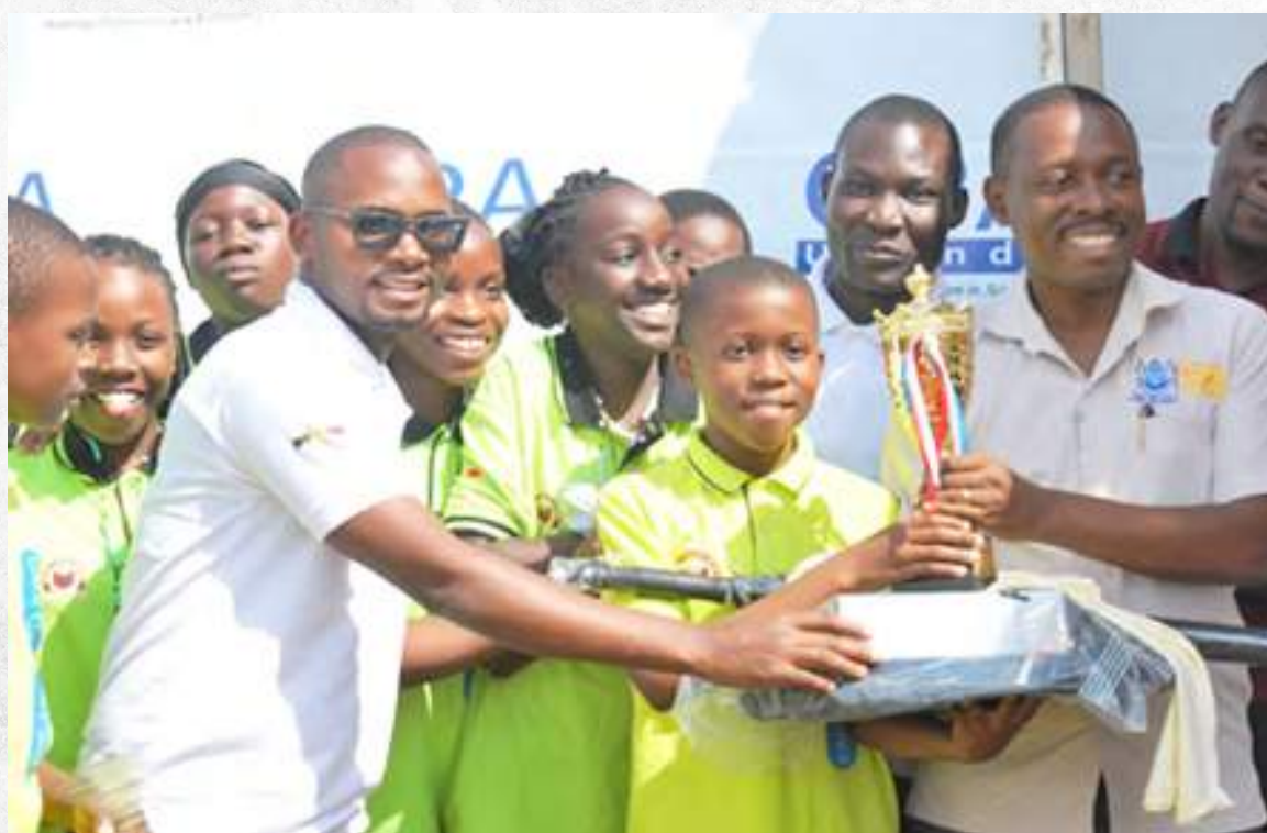
One of the winners after receiving their prize