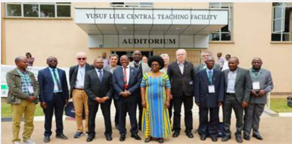
Some of the participants with the Minister and Vice Chancellor of Makerere at the opening ceremony