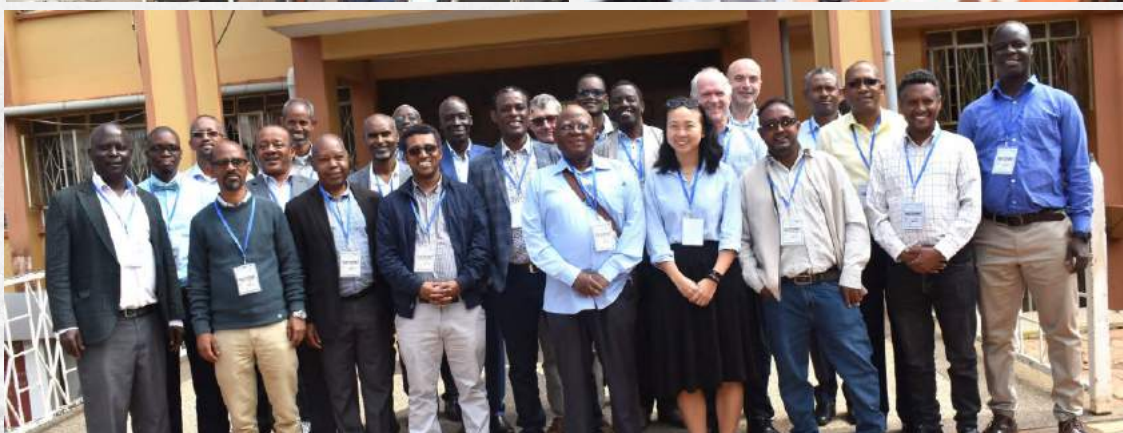
The UNET Project team during the workshop at Senate Building, Makerere University