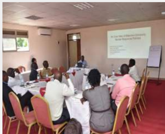
Officers from the DRGT and the Directorate of Human Resources briefing CoNAS leaders on the different policies