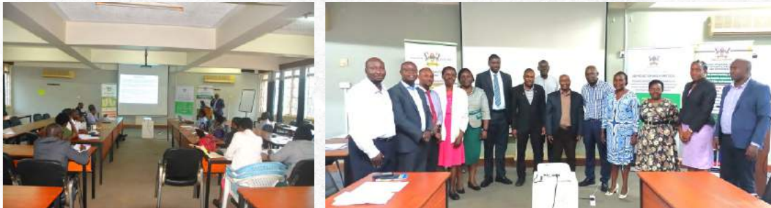
The project team during the meeting at Makerere