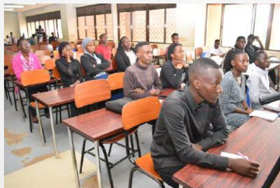
CoNAS staff and students at the Public Talk delivered at JICA Building on 15th March 2023