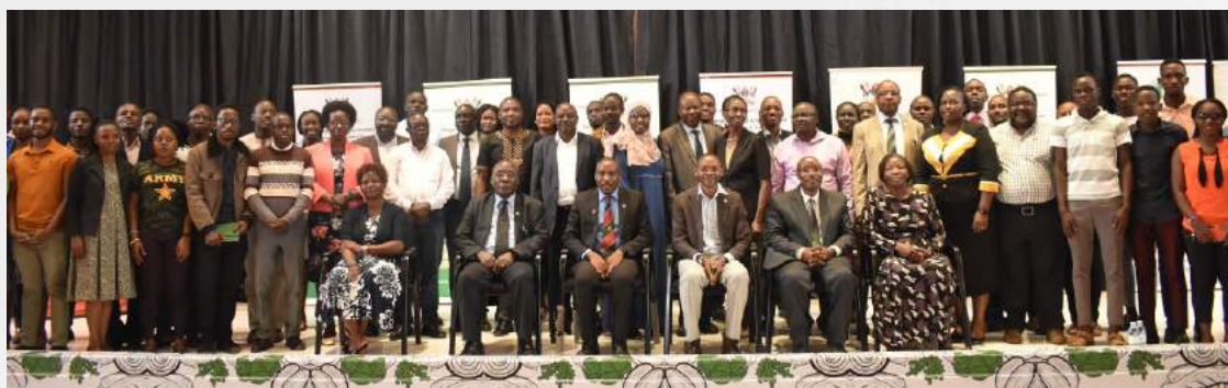
Participants at the BioSU inception meeting held at Makerere University on 5th May 2023

contribution to national development. On 5th May 2023, the School of Biosciences held an inception meeting for BioSU. The meeting brought together Biology professionals who deliberated on a number of issues in line with the formation of the BioSU, and the continued failure of the subject of Biology. The meeting featured a panel discussion in which a number of factors undermining performance in Biology were highlighted and possible solutions proposed.