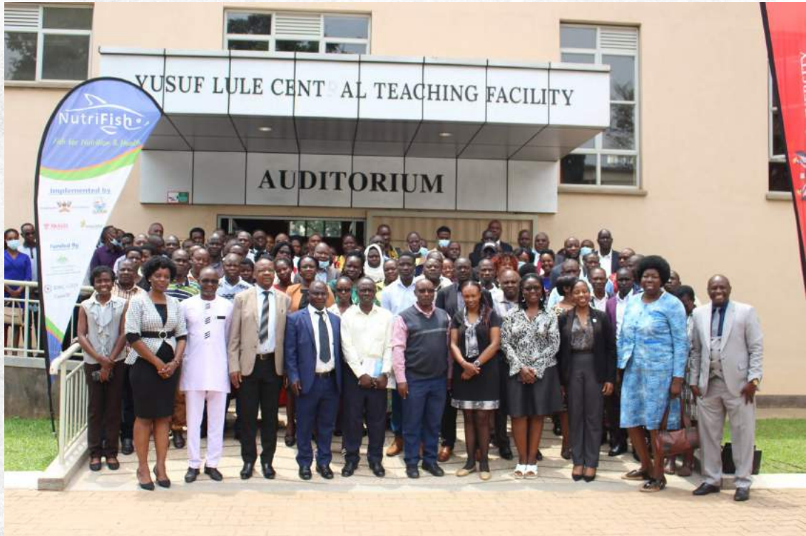
Some of the participants at the launch