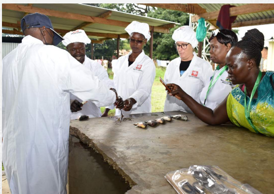
The farmers being equipped with skills in different aspects of aquaculture