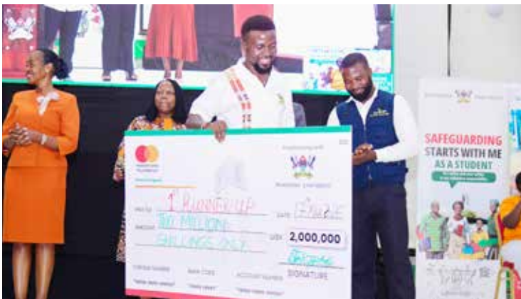
The Annual Safeguarding Signature Message Contest Award Ceremony engaged students in developing the 2026 key awareness message