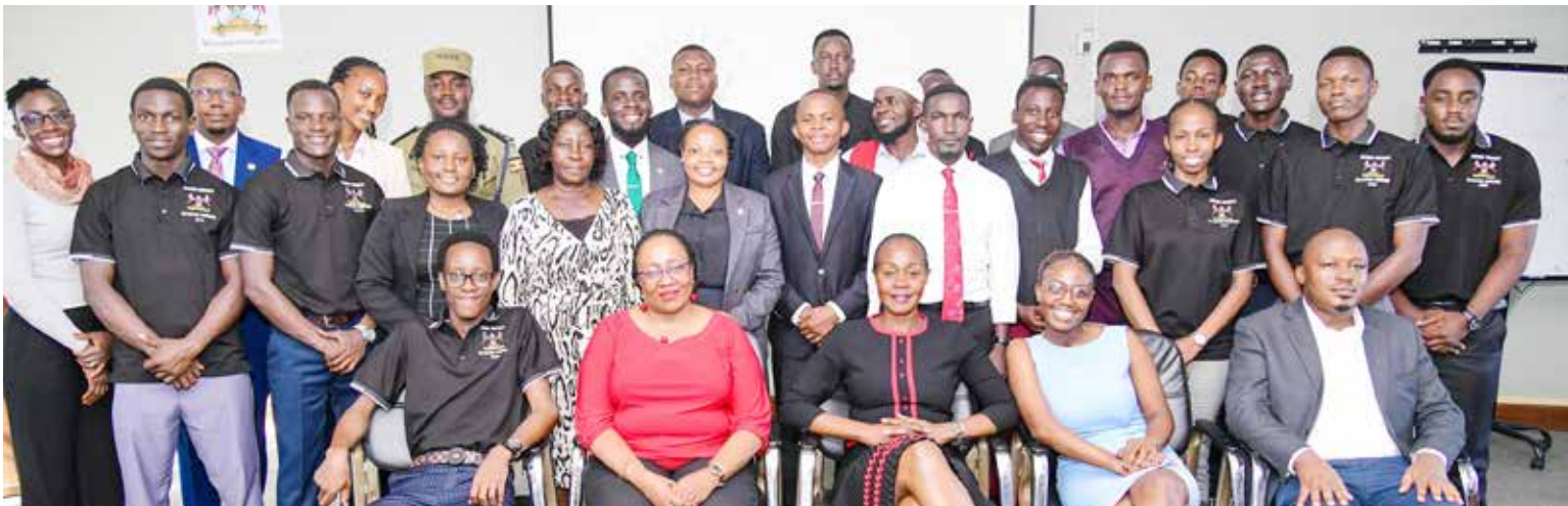
The Office of Dean of Students at the briefing meeting with 92nd Guild Presidential Aspirants to ensure a free and peaceful election.