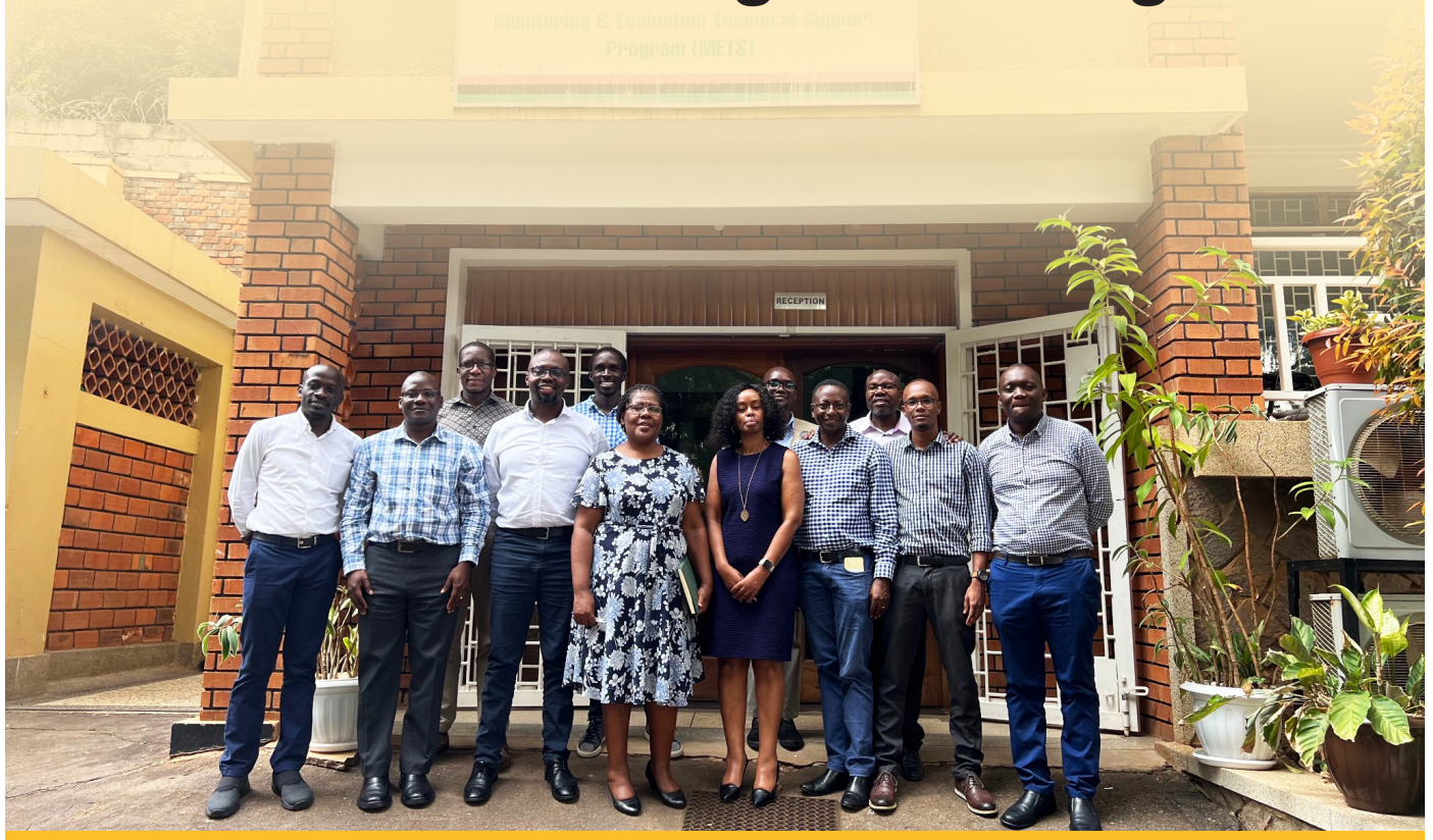
CDC Kenya, CDC Uganda and the MakSPH-METS team after the debrief meeting at METS offices.

PEPFAR supported countries procure the required HIV/TB commodities, and upon arrival in the country the commodities are inventoried, segregated, stored, and distributed to intended beneficiaries. However, commodity management challenges are often faced by majority of the countries.