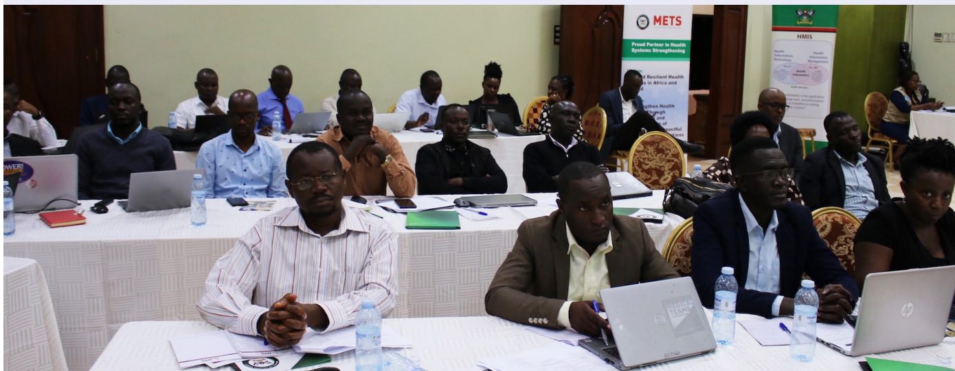
Some of the participants at the meeting

stakeholders from the Ministry of Health-AIDS Control Program (MOH-ACP), PEPFAR Coordination Office, US Government Agencies, and various implementing partners.