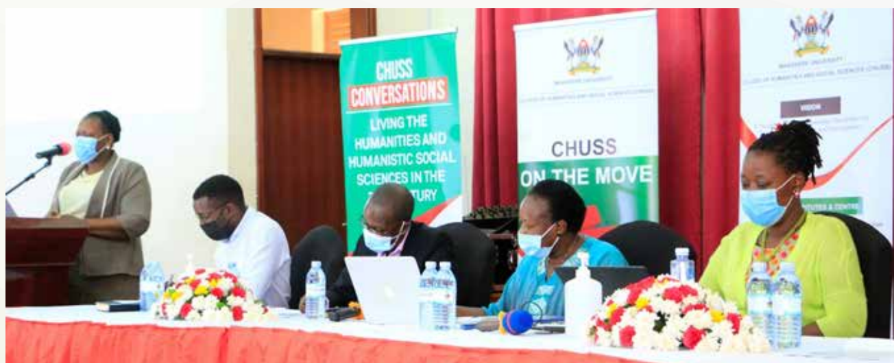
CHUSS early career scholars who presented during the conversation