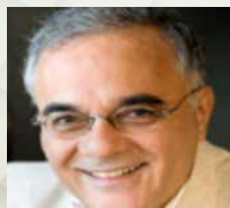
Prof. Mahmood Mamdani Director MISR