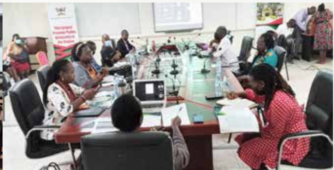
Now a SMART ROOM for online meetings and audio visual lectures