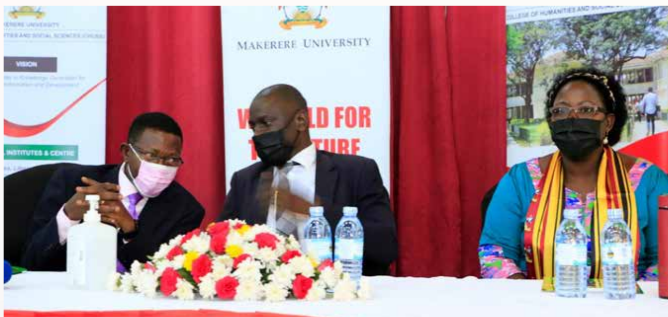
The conversations focused on two sub-themes namely Humanities and Governance

On 9th December and Friday 10th December 2021, CHUSS held a conversation on the theme, "Living the Humanities and Humanistic Social Sciences in the 21st century" at the CEDAT Conference Hall, Makerere University. The conversation aimed at bringing both practitioners and scholars in the humanities to dialogue on the impact of the Humanities and Humanistic Social Sciences on contemporary issues of governance, insecurity and life-threatening epidemics and pandemics.