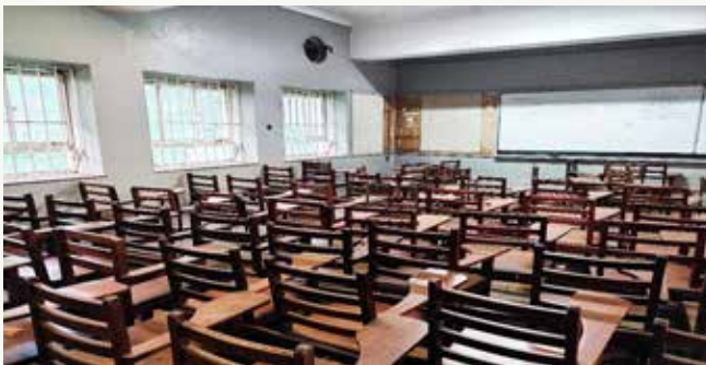
Former Lecture Room 1

An ordinary lecturer room was refurbished into a SMART ROOM. The SMART ROOM is a facility that can be used to host zoom meetings and audio visual lectures. The facility has a camera to capture participants and a screen that displays the video and audio systems to online and physical participants in the room. The room is furnished with other accessories including microphones and chairs. See photos before and after.