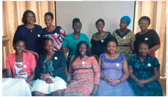
Bereavement champions and peer supporters

The feasibility of research to evaluate the intervention was assessed with 44 women in Kenya and Uganda, recruited after the bereavement champion group had been introduced, who were offered peer support. Their experiences and outcomes were compared with 56 women cared for in the same hospitals, before the change was introduced. Despite COVID 19 interrupting the research, women were willing to take part and stay in the study until completion. Initial data suggests overall positive experiences of the intervention and a few improvements which could be made in a larger trial.