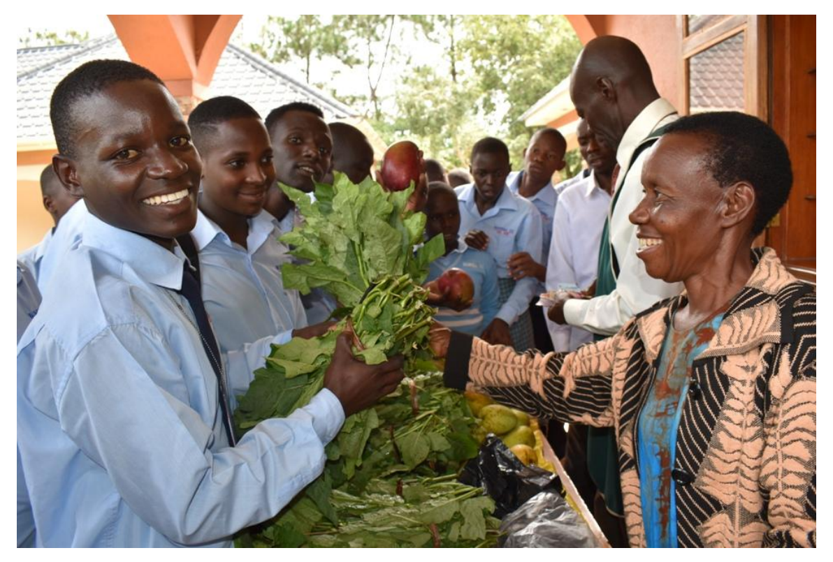
Students on a different function at the hotel thronged the farmers stall to buy fruits and vegetables during the workshop

Farmers said, they were able to grow more than one vegetable all year round targeting period of high prices and increased capacity for bulking and collective marketing of vegetables.