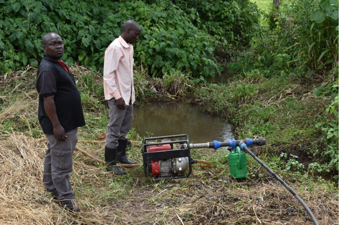
The above three pictures show some of the water harvesting technologies introduced to the farmers

Training was done on-farm to guarantee hands on-skills development. Emphasis was placed on farmer to farmer peer extension i.e. use of experienced farmers to train the less experienced