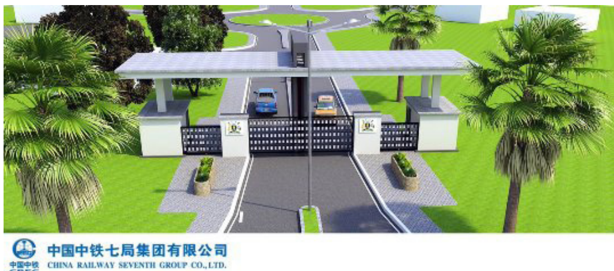
Artistic Impression of the completed Main Gate Entrance to Makerere University after Completion. Image: KCCA