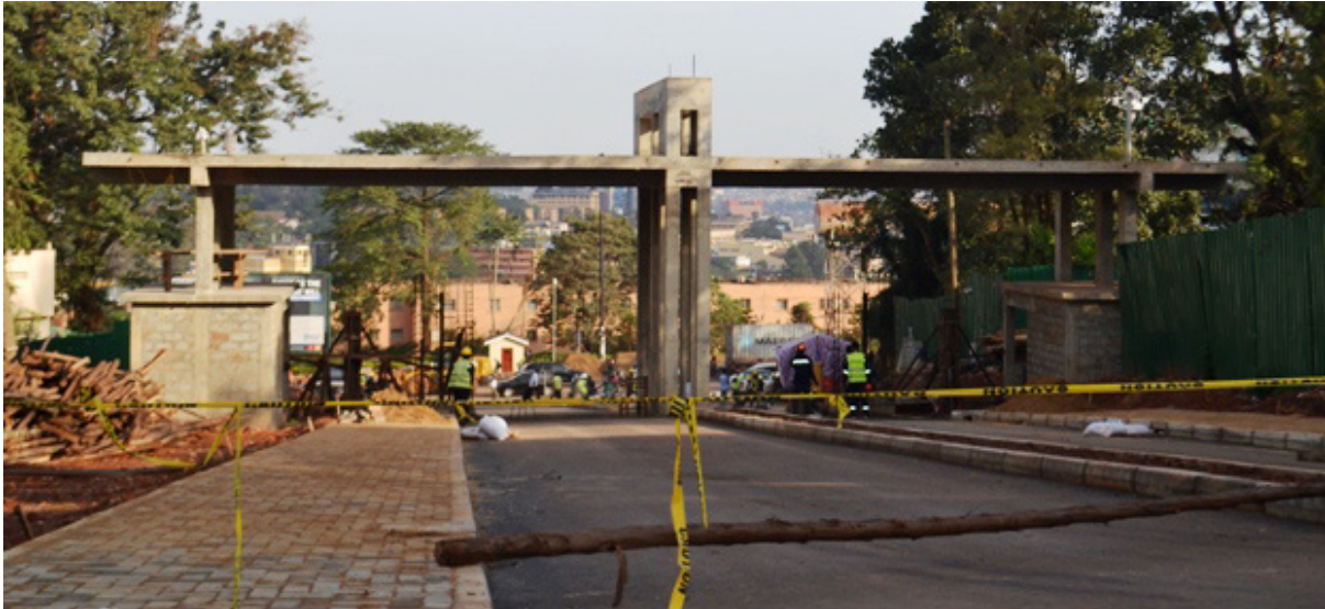
Latest images of ongoing works at the Makerere University Main Gate under the Mak/KCCA MoU