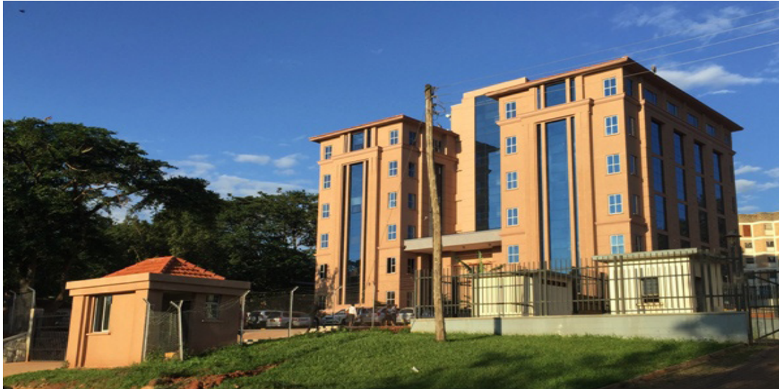
The IDI Building at Makerere University Main Campus