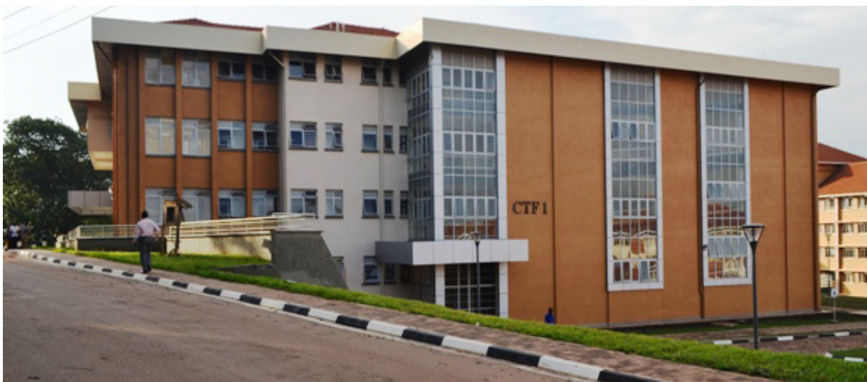
The Central Teaching Facility1 located next the School of Social Sciences