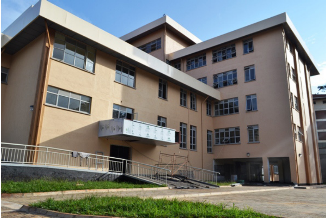
The Central Teaching Facility2 located next the College of Business and Management Sciences