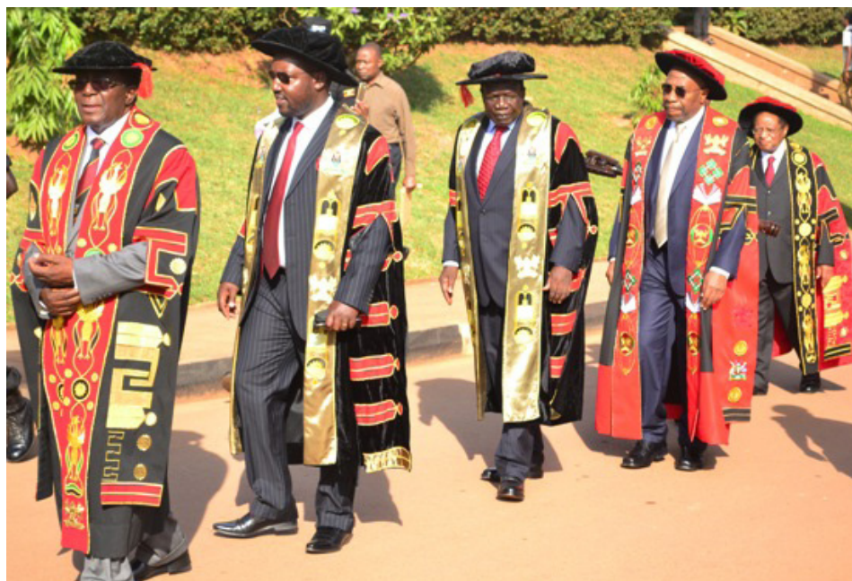
Rt. Hon. Dr. Ruhakana Rugunda (2 nd R) in the 67 th Graduation Procession