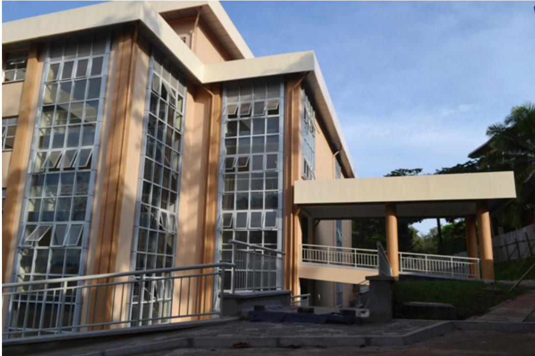
The Central Teaching Facility 2 located next the College of Business and Management Sciences