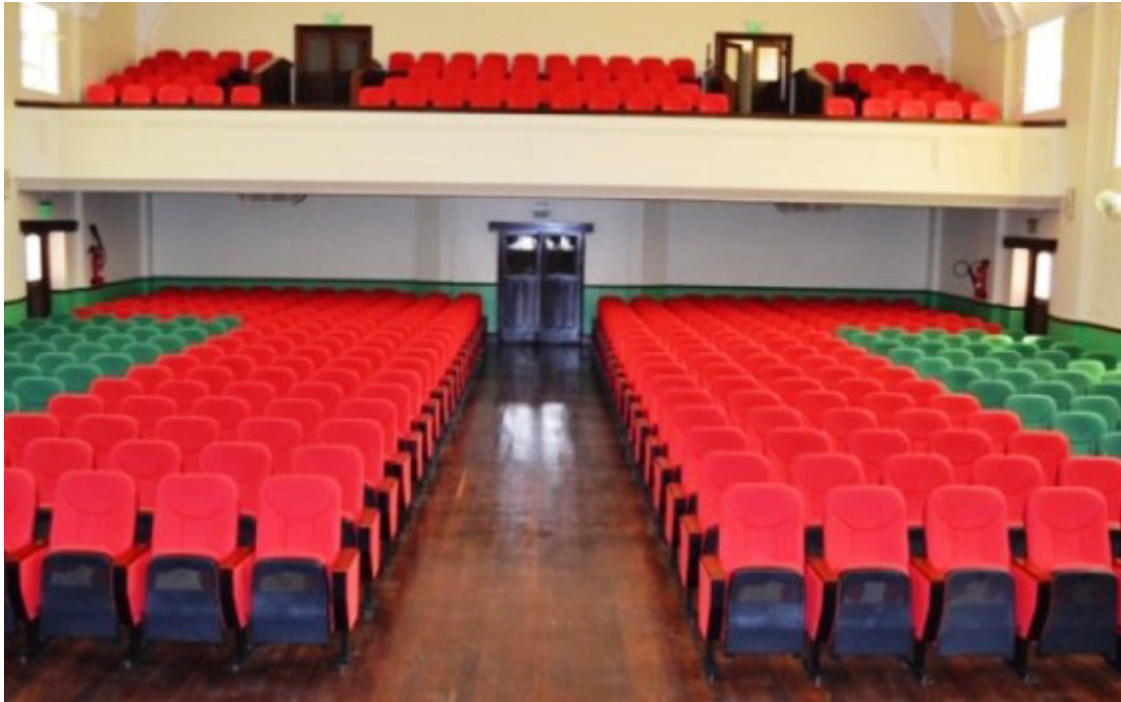
The refurbished Makerere University Main Hall in 2015 thanks to a MakSPH-sponsored facelift