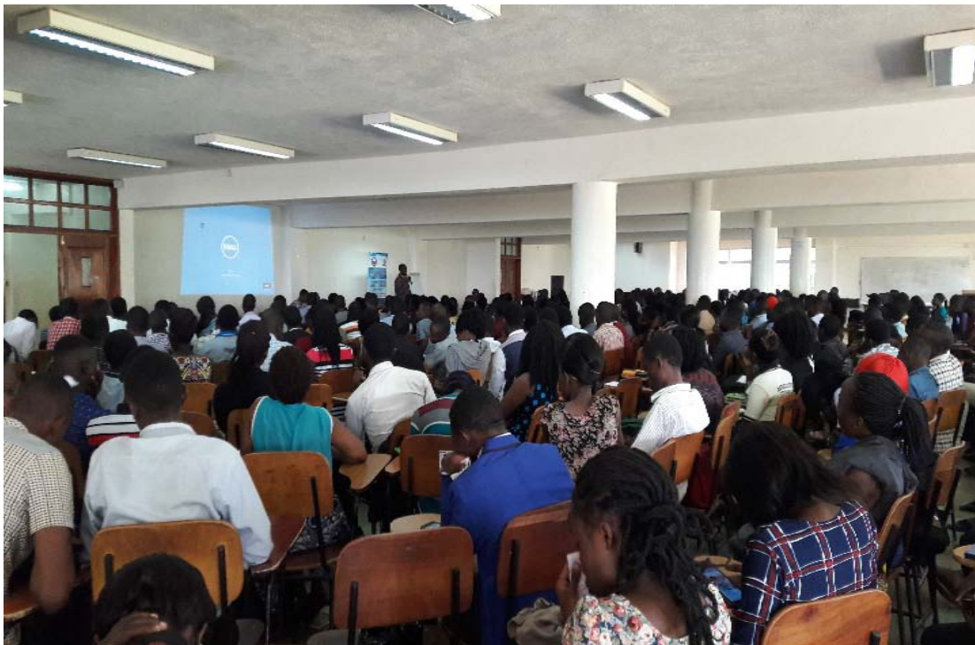
Students during the training