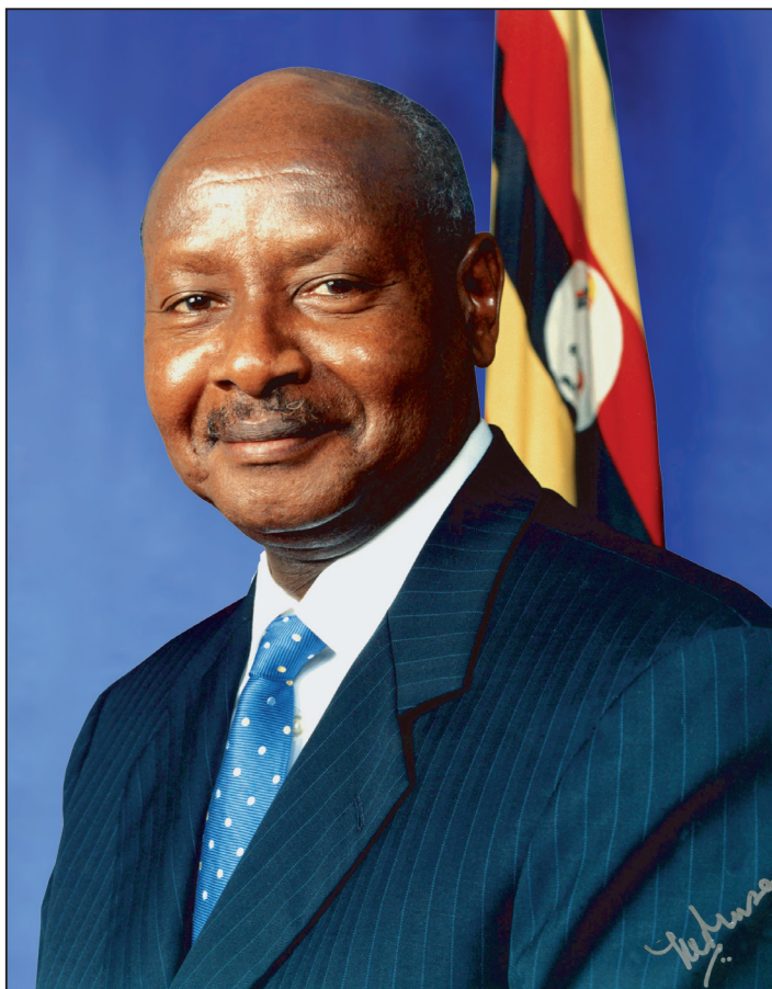
His Excellency Dr. Gen. Yoweri Kaguta Museveni PRESIDENT OF THE REPUBLIC OF UGANDA AND VISITOR OF MAKERERE UNIVERSITY