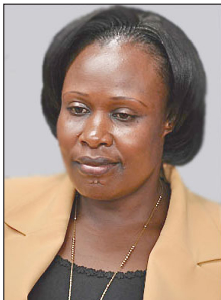
Hon. Maj (Rtd) Jessica Epel Alupo, MP MINISTER OF EDUCATION, SCIENCE, TECHNOLOGY AND SPORTS