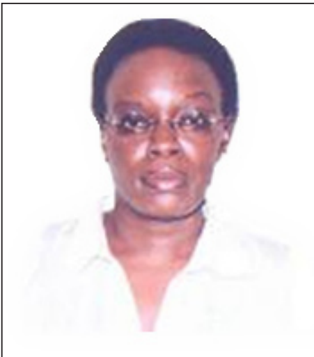
Hon. Irene Ovongi-Odida DEPUTY CHAIRPERSON, COUNCIL