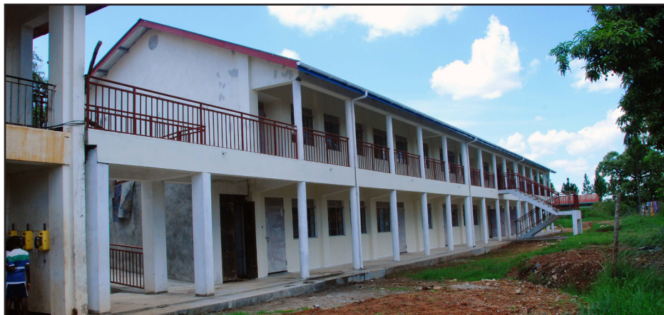
New block at Tororo College built with ADB funds.