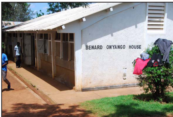
One of the blocks of Bernard Onyango House at St.Peter's College Tororo