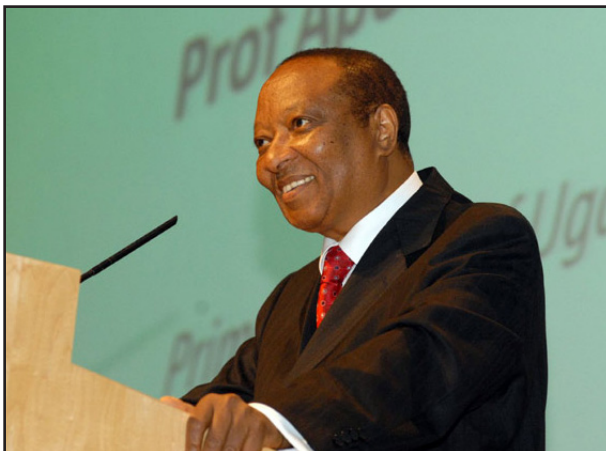
Apolo R. Nsubambi - Prime Minister of Uganda (emeritus) and Professor of Political Science; First Non-Head of State Chancellor of Makerere University.