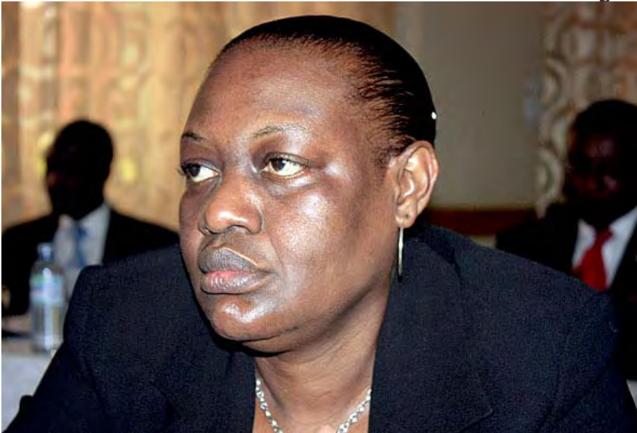
High Court judge Irene Mulyagonja Kakooza

By RICHARD WANAMBWA (email the author) Posted Friday, April 13 2012 at 00:00