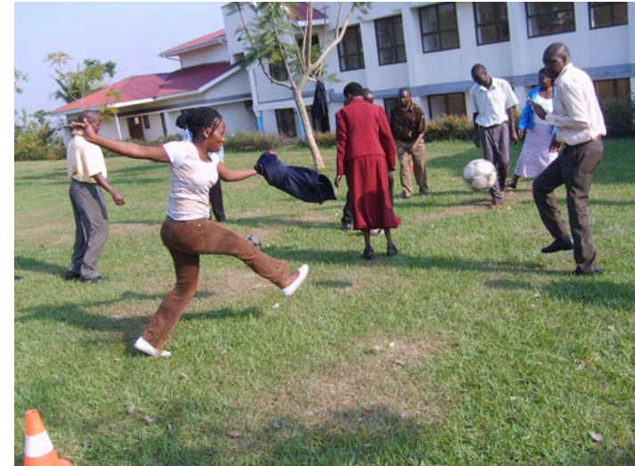
Above: An indoor activity (inside the training hall) & right: an outdoor activity