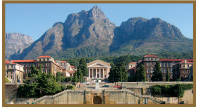
University of Cape Town

improve policy development and implementation that promotes the mental health of communities in Africa.