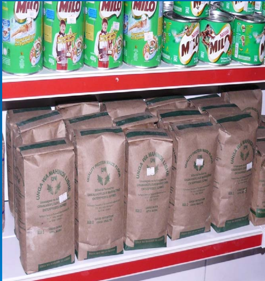
QPM flour in supermarkets Tanzania