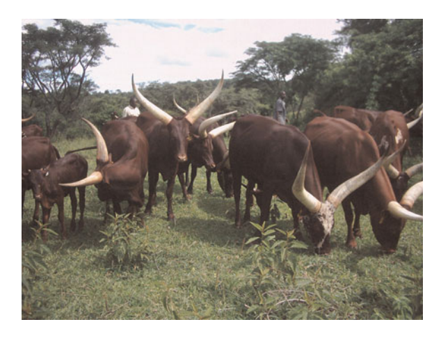
Plate 4. A herd of Ankole cattle grazing, note the tree cover on the range.

Pastoral systems are characterized by the use of range grasslands, migratory herding and livestock breeds that are tolerant to migration stress, droughts and periodic food and nutritional shortages (Groombridge, 1992). Livestock owners exploit natural grasslands mainly in the relatively dry areas of Uganda (Twinamasiko, 2001). Pastoralists are more sedentary today than in the past, and mainly move to find pasture and water in times of drought. The main source of food for pastoralists is milk; however, production per unit area is low (Petersen et al. , 2003). Producers generally have minimal control over