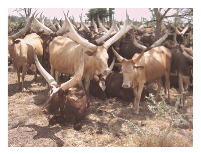
Plate 9. Three generations in one photograph, standing in the front row, from left to right is a dam, daughter and grand-daughter.