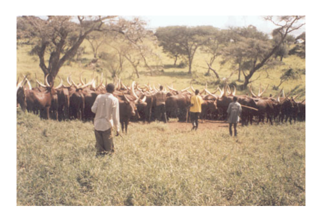
Plate 3. A herd of Ankole cattle being driven to graze.

and Mawoggola in Sembabule district (Table 2). Each county ( Ssaza ) is further divided into subcounties ( Gombolola ) that are decentralized governments. The subcounties are made up of several parishes ( muluka ), each of which is subdivided into villages whose residents form the local council one, the smallest administrative unit.