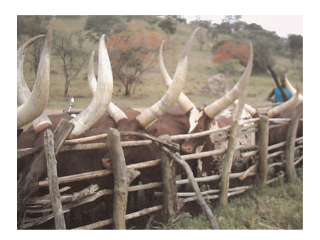
Plate 7. Ankole cattle in a confinement crush during spraying against ecto-parasites.

the feed resources and therefore limited opportunity for their improvement. The pastoral system uses few commercial inputs and the cost of production is usually very low (Mwebaze, 2002).