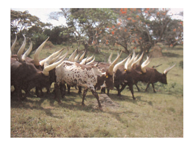
Plate 6. Ankole cattle approaching home, note the long and graceful horns.