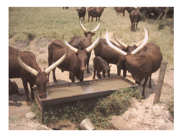
Plate 5. Ankole cattle at the water trough.

Agropastoralists are sedentary farmers who cultivate food crops both for subsistence and sale while also keeping livestock. Their animals use communal grazing land, fallow land and crop land after harvest (Twinamasiko, 2001). Livestock is used for draught, savings and milk production. The agropastoralists have little control over the feed resources. Milk production fluctuates with the seasonal availability of feed; hence, feed supply could be