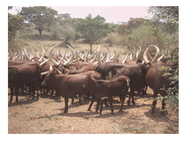
Plate 2. An Ankole cattle herd of mostly the one preferred colour, dark brown ( Bihogo ).

The study used a descriptive, purposive and stratified survey design and was carried out in Ankole cattle keeping households of Uganda, in the districts of Kiboga (n = 60), Mbarara (n = 137), Mpigi (n = 30) and Sembabule (n = 21) (Figure 1, Table 1). These districts have the highest Ankole cattle density in Uganda. Each district is divided into counties. The counties selected for this study were Gomba in Mpigi district, Kazo and Nyabushozi in Mbarara district, Kiboga in Kiboga district