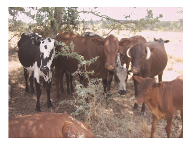
Plate 8. The diversity of the horning condition among Ankole cattle. The names of the cows standing from left are Kachweka (i.e. broken horns), Nkungu (i.e. polled), Nshara (i.e. drooping horns).

A questionnaire was administered to the 248 households to generate data on reproductive parameters in cows and bulls. Milk production data were provided by farmers who relied on their memorized records. One mature breeding bull and one cow were then randomly selected from each surveyed household. Live body weight (BW) and six body measurements were then taken on the selected 120 bulls and 180 cows. The studied animals were mature active breeders. Maturity was ascertained from possession of either three or four pairs of permanent teeth. A descriptor list of phenotypic characteristics to assist with the qualitative description of the animals, a colour chart to describe the coat colour of the animals, and calibrated tapes and callipers to measure the quantitative physical characteristics such as heart girth (HG) and body length