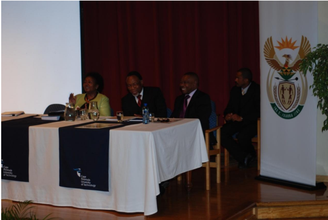
Photograph taken by CPUT photography student at the HE Summit, 22 April 2010