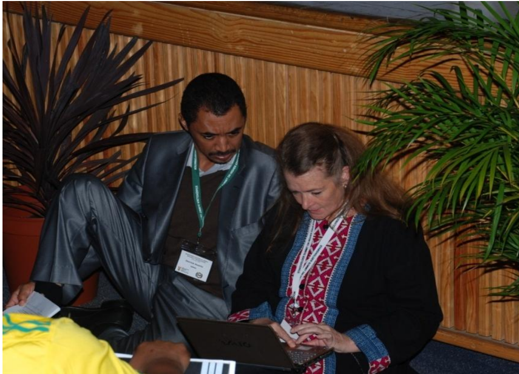
Photograph taken by a CPUT photography student at the HE Summit, 23 April 2010

and discussion both within and outside of the academy. In conclusion, Professor Burawoy highlighted that, “the irony is that the university protests that have spread across the Global North – United States, England, France, Germany, Austria and beyond – during the last year are all groping toward a model of deliberative democracy in public education, a model that South Africa almost takes for granted, that it inherits from its past. It’s not perfect, and ultimately it has to deliver reform, but it is an important beginning from which we can all learn.”